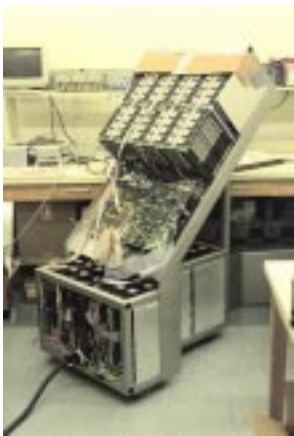
Figure 2: J-Machine

revising the chips in early 1992 to correct a few bugs, we built three J-Machines: a 1024-node machine at MIT and 512-node machines at Caltech and Argonne. In parallel with the hardware development, several software systems were built for the machine [HCD89, Wal92, SD91, Mask941.